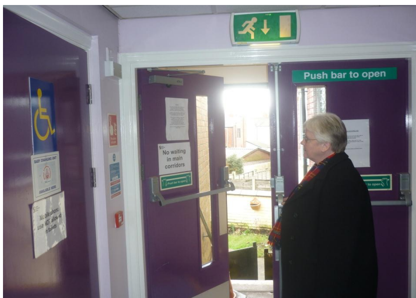
Entrance to the fire exit